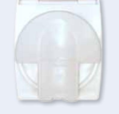
Base for mast installation (incl.)