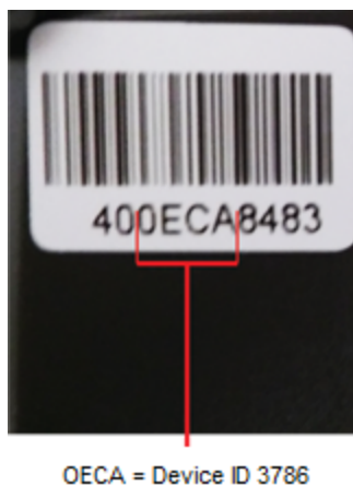
Figure 3-2 Device ID in hexadecimal code