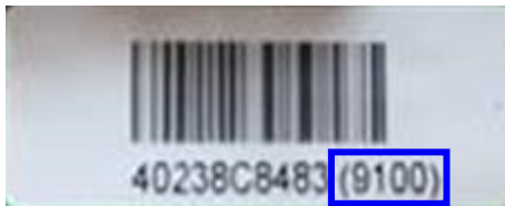
Figure 3-1 Device ID in decimal code