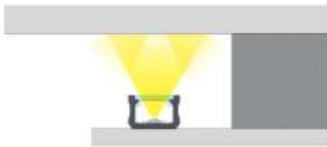
Decorative effect of installing profile X behind the edge of a mirror