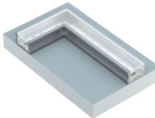
Connecting profile X with a GUM cover at 90°